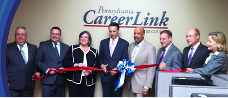
Photo above: Grand opening of the United Way Financial Stability Center in 2014

The top client needs continue to include budgeting, credit repair, debt relief, employment, housing, and transportation—core services that directly address the challenges many residents face daily. Thanks to our strong partnership with over 30 local agencies, the center has served more than 2,500 residents , empowering them to achieve lasting financial stability.