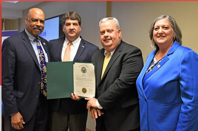
United Way of Chester County was honored by Chester County officials for the work of the Financial Stability Center.