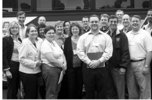
Chester County 101 Tour October 19, 2006